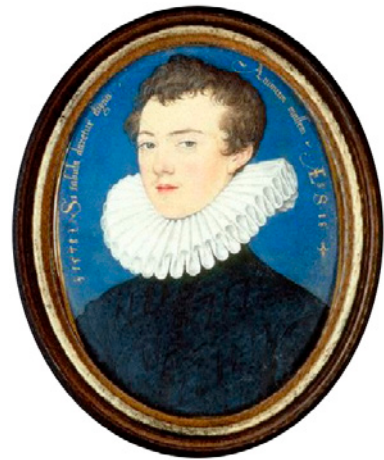
The Young Bacon – inscription around his head reads: Si tabula daretur digna animum mallet "If one could but paint his mind" – National Portrait Gallery, London ; Nicholas Hilliard, Public Domain, via Wikimedia Commons

The Parliament of men of property had just executed the King of England in the name of the people ... The people of England—or at least too many of them for the liking of Parliament—now wished to see the construction of a "truly" Christian society, each sect according to its own special divine illumination (Easlea 1980 p.131).