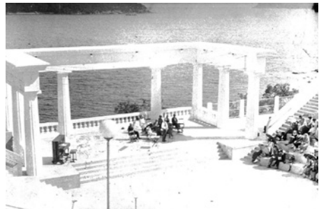
The Amphitheatre on Balmoral Beach