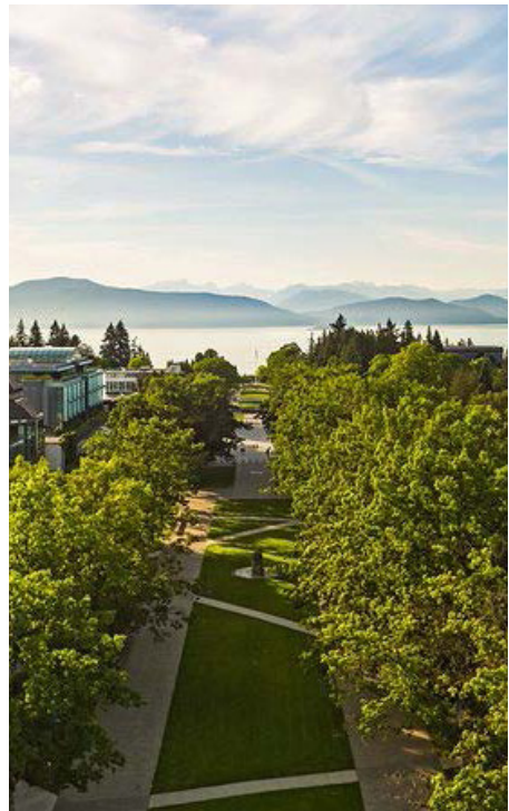
The University of British Columbia Campus facing North along Main Mall

The Congress will be held in the idyllic setting of the University of British Columbia, which is surrounded by beaches, gardens and magnificent temperate rainforest.