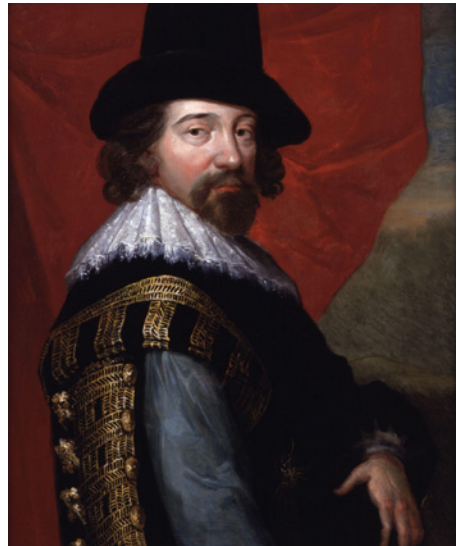
Sir Francis Bacon, c. 1618

The Nobel Prize-winning physicist Wolfgang Pauli had a profound interest in the mystic and scientist Johannes Kepler and the alchemist and Kabbalist Robert Fludd. Following the suicide of his mother, and his painful divorce, Pauli took his father's advice and consulted the renowned Dr Carl Jung. Jung decided to hand Pauli over to a female analyst instead of consulting Pauli himself, but the two entered into an extensive correspondence from