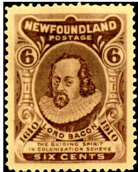
Lord Bacon – the guiding spirit of colonization scheme: Newfoundland, Public Domain, via Wikimedia Commons

Salomon's House consisted among other things of laboratories the largest of which were deep caves used for refrigeration and conservation of bodies, the production of new artificial metals, the curing of some diseases and the prolongation of life. New Atlantis also boasted of high towers used for the observation of meteors and weather events. Experiments were set up to imitate and demonstrate natural phenomena, to test cures of diseases, to grow fruits and other produce from which wine and bread and other foods were produced. New Atlantis was big on experimenting with foods, including breads of various grains, with flesh and fish and various seasonings added as well,