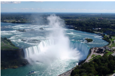
Maid of the Mist at Horseshoe Falls (Niagara Falls)

and who desire to enter within its influence.’ It is dedicated to those who are ignorant of a particular approach to Reality, but who are sufficiently aware to sense a great value ‘within its influence’. Probably the shortest dedication is that of The Voice of the Silence : ‘Dedicated to the few.’ This is not a book for popular consumption or one intended for the broad public, but the one that HPB described as for ‘those few real mystics within the Theosophical Society’. She further said that this book would surely speak to their needs. This is the hierarchy of these particular books. They all lead us along a path that goes in a specific direction, and they culminate in this work that we will be considering in our time together: The Voice of the Silence . Humanity has a very specific role in the economy of Nature. The human element is a transformative one. No other aspect of the natural world has this capacity that humanity does. It is something that we develop through practice. Ultimately, practice leads to a point where practice is not necessary. It takes great effort to become effortless. These works are intended to guide us to stand up and fulfil the role that we are here for as individuals, but, more importantly, as that organ within the greater body that is described as humanity.