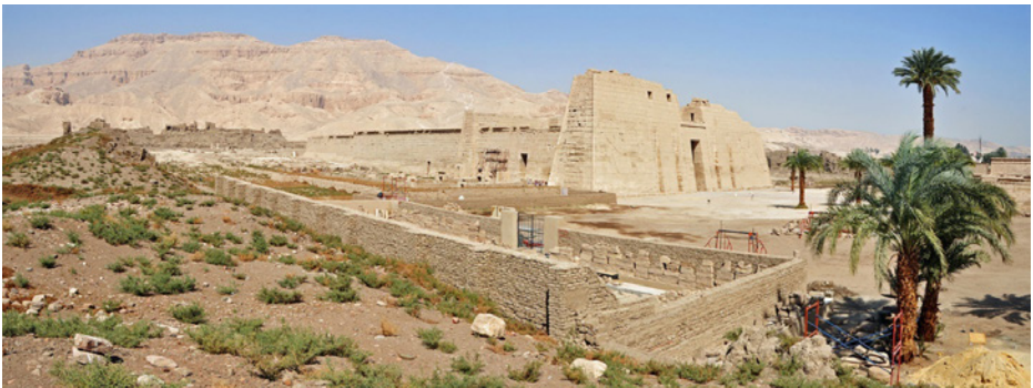
Mortuary Temple of Ramesses III, Medinet Habu, Egypt, general view from the south

I have an astronomy textbook (from a used bookstore) published in 1919 by a professional astronomer from a UK observatory. The author discusses the major controversy of the time. This was over the nature of the 'nebulae'; were they mostly gaseous or mostly