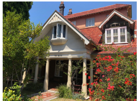
The Manor as it is today