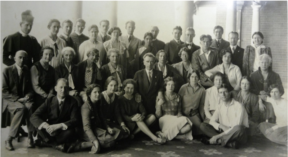
The Manor residents c.1930

While The Manor is not available for casual accommodation, a number of National and International TS Lecturers have been put up there, as well as Members of the Australian Section's National Council and Executive Committee, as a support to the TS. It has also been visited by various International Presidents of the Society and international TS speakers over time.