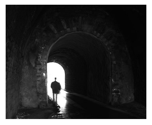
Photographic illustration of a near-death-experience

Let's have a look now at what happens to those constraints of the brain, particularly associated with a neardeath experience. People are now looking at these as the sort of typical characteristics of the near-death experience; generally, seeing oneself outside one's body, a feeling of peace, being able to see the dark tunnel, meeting beings of light, etc. There's a whole range of them. People have tried to describe these in terms of simple changes in the activity of the brain, as the result of disordered brain processes.