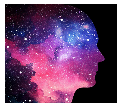
Human head on starry space background

frequency and very low amplitude suggesting that the cortex is not doing anything. But more recently people have found that animals at the time of death, experience a sort of a burst of uncoordinated activity. And sceptics have said that those subjective experiences are due to this kind of activity. I would argue that if it was uncoordinated activity, you wouldn't be having the type of highly structured experiences that people actually report in near-death experiences (NDEs). It doesn't explain why key aspects of NDEs are consistent across cultures. And it certainly can't explain the accurate reports of unusual events that people are able to report on when they are out of body. It would simply appear to be an attempt by sceptics to say that there is no substance to NDE reports. But I think the evidence points against that very strongly.