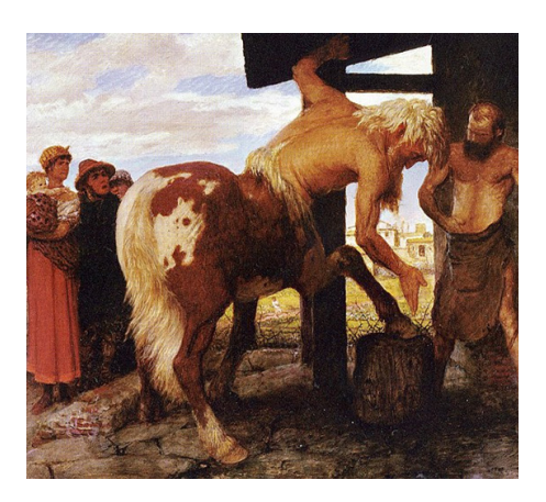
Centaur in the Village Smithy (Arnold Böcklin)

So, what are these filters within the brain? Well, we know that there are inhibitory systems within the brain